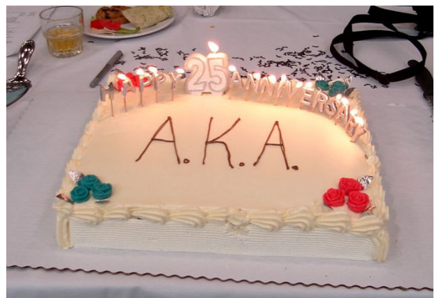
The AKA celebrated its 25th anniversary at Singposium 2008.

Have a wonderful summer and we'll see you in the fall!